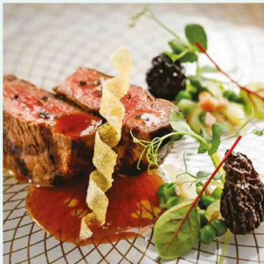
Grilled U.S. Prime Angus Beef Tenderloin 烤美國頂級安格斯牛柳