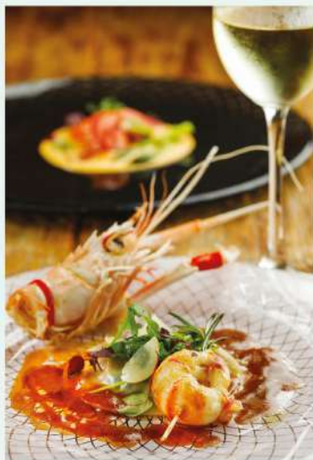
Langoustines, Duck Ravioli on Veal Jus 深海小龍蝦伴鴨肉雲吞配牛仔汁