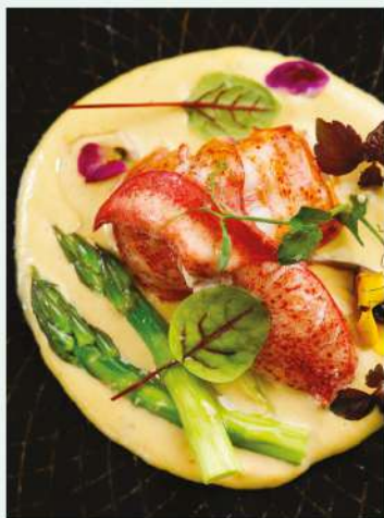
Seared Lobster with Sea Urchin Cream Sauce 香煎龍蝦配海膽忌廉汁

Enquiries and reservations 查詢及訂座：2812 3928